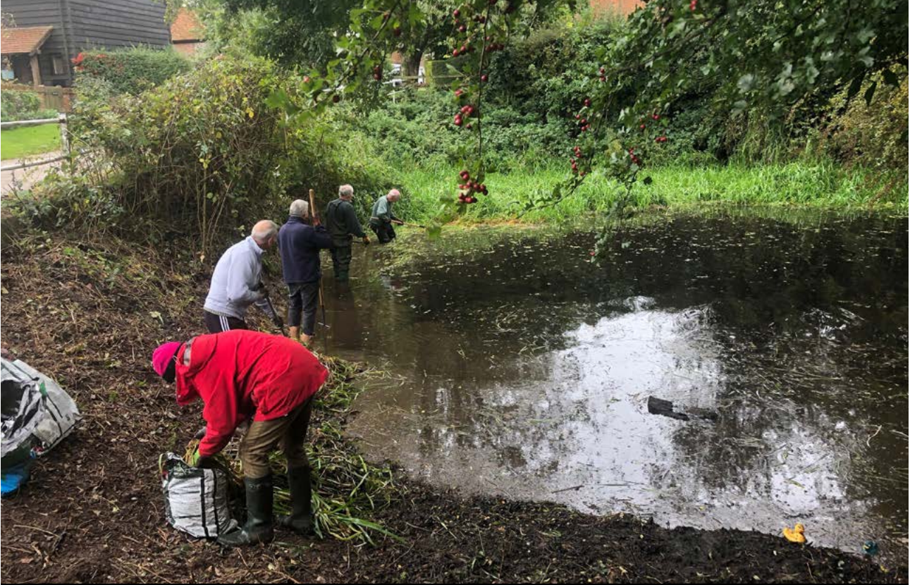
Horts committee members giving a hand cleaning to clear the pond on Kiln Lane