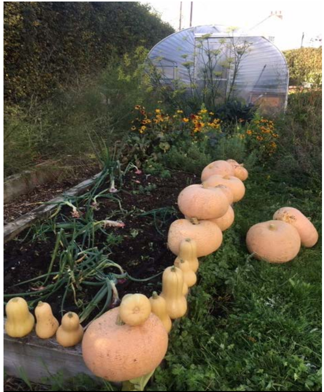
Squash and pumpkins