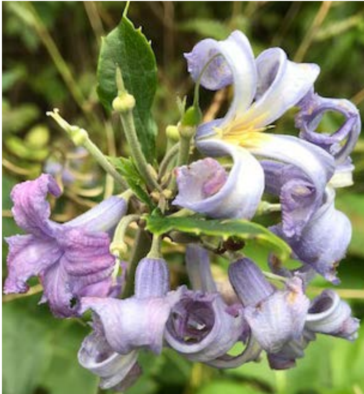
Herbatious clematis bought at our talk a couple of years ago