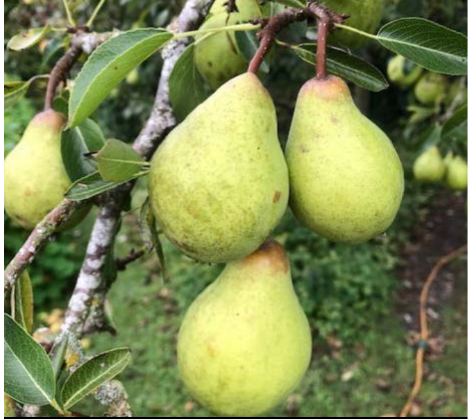
Pears in abundance for the first time in 30 years!