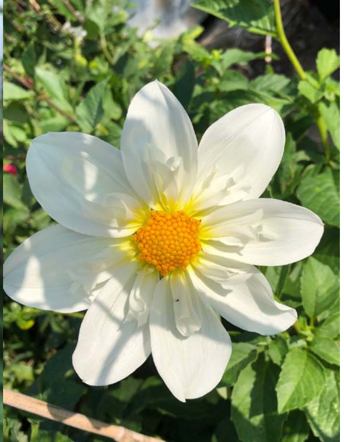
Dahlias still going strong