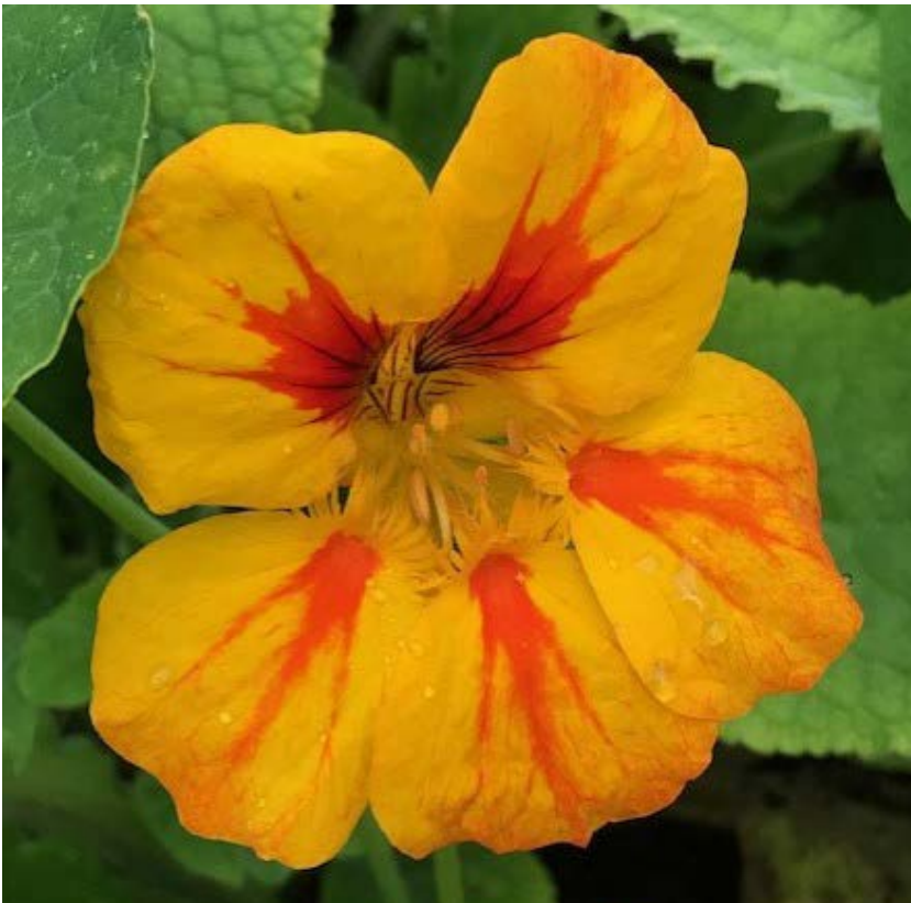
Nasturtiums doing well