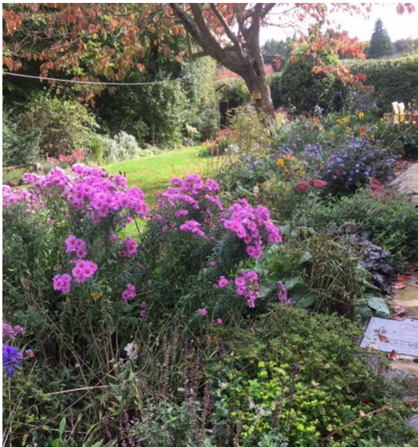
Still lots of colour in the garden at this time of year