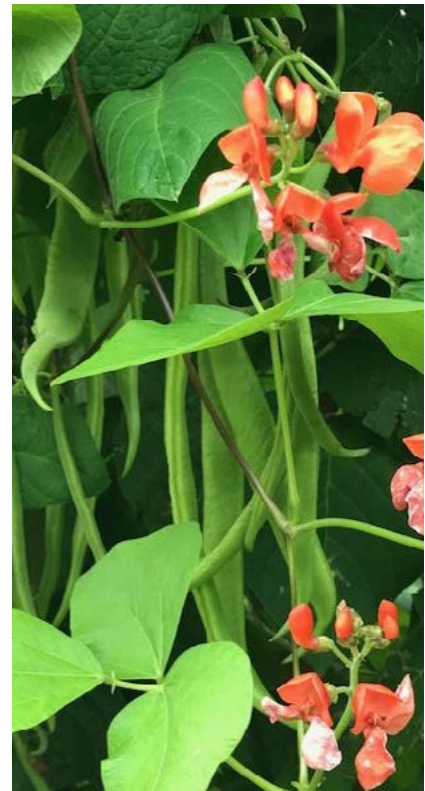
Runner beans flowering and fruiting at the end of September