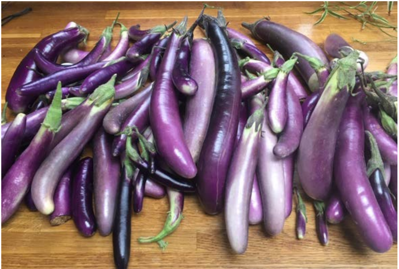
The Aubergines just keep on coming