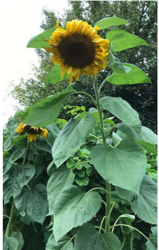
Sunflowers still looking good