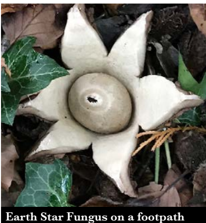
Earth Star Fungus on a footpath